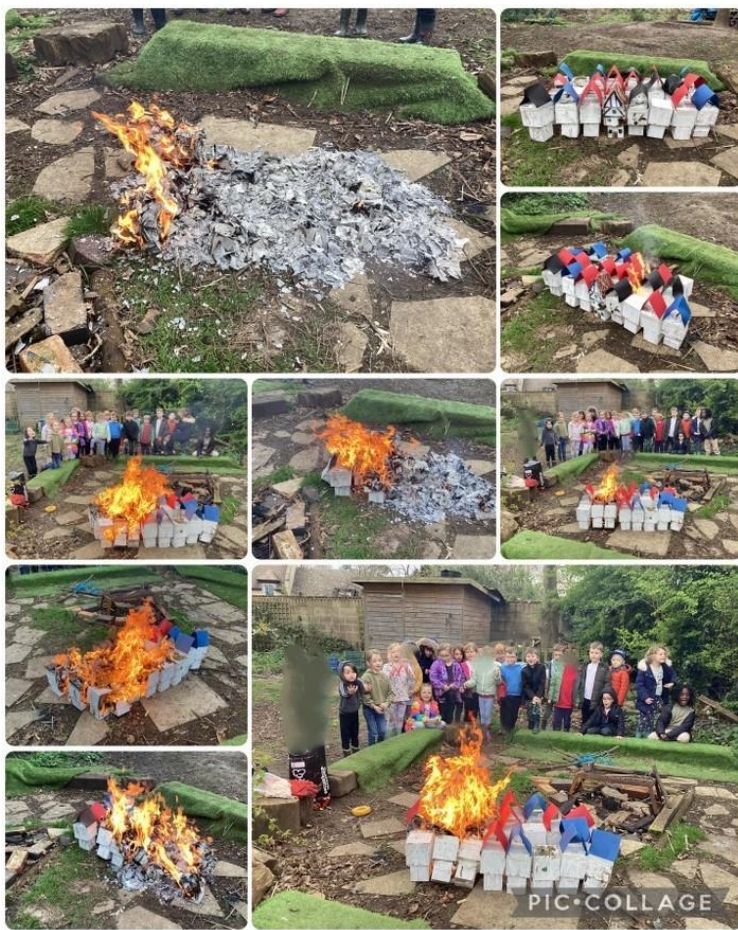
Badger Class enjoying reenactment of the Great Fire of London.